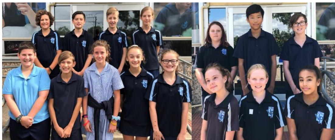
2019 Student Ambassadors

It gives us great pleasure to introduce our newest group of student leaders for 2019. We were so proud of our students who submitted their applications and were subjected to an informal interview. We hope they enjoy their year as leaders in our school.