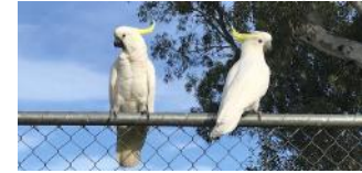
The Orchard was under the watchful eye of these two!

A big Thank you to the following families for their help in the Summer Holidays looking after the Chickens and Garden.